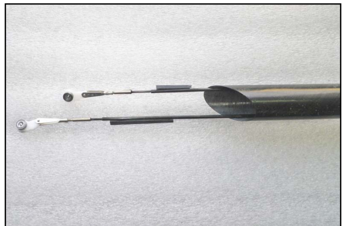
Pic.4 - balsa plywood for fixation rod tubes to the fuselage

11) Disassemble the fuselage and glue on the edges of the tubes rods pieces of balsa plywood or other material for fixation rod tubes to the fuselage. The width of these bands make according to claim 10. Be careful that the superglue will not filled the rods for this keep the tail boom rudder side to the bottom.