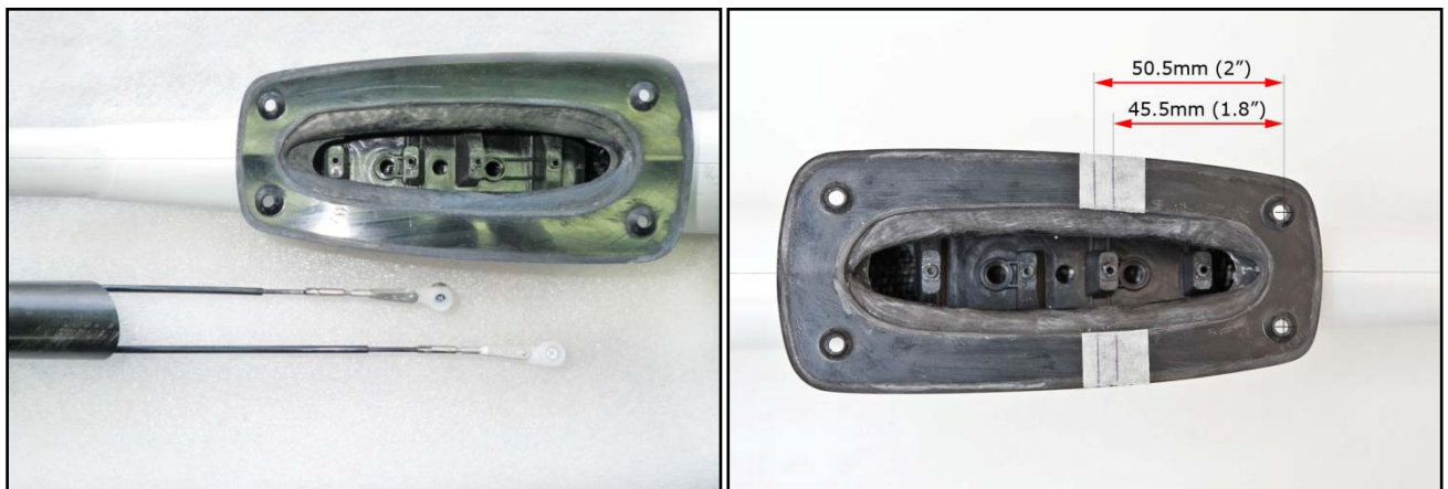
Pic.2 – Preparing the fuselage to install servo platform

4) Prepare the servo-horns with 12mm arm