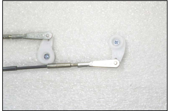
Pic.3 – Bonding of pushrod and horns rods of tail

7) Remove the boom from the fuselage and measure the distance from your marks required to clevis and thread rod tip installation (clevis must be adjusted to \pm 3 mm at the rod tip). Cut the carbon rod according to your measure. Cut the rod tube to the edge of the 10mm longer rod tip. Sand the gluing spot in the rod by № 320-240 sandpaper and glue the rod tip by superglue. Note: keep the tail boom vertically with the fir in top, so the flown superglue will not fix the pipe to the rod.