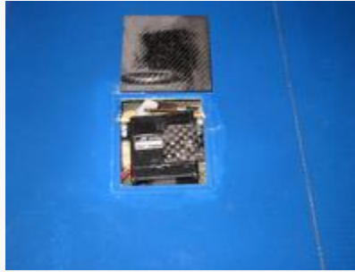
Aileron installation for Supra. Pre-

cured carbon piece glued to servo and inside of wing lower skin 67.5 KB · Views: 40